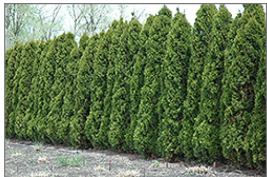
Hetz Wintergreen Arborvitae