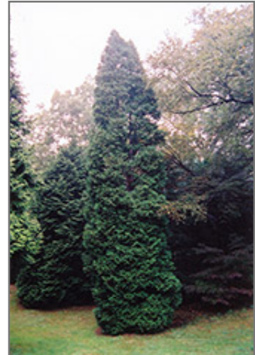
Hetz Wintergreen Arborvitae