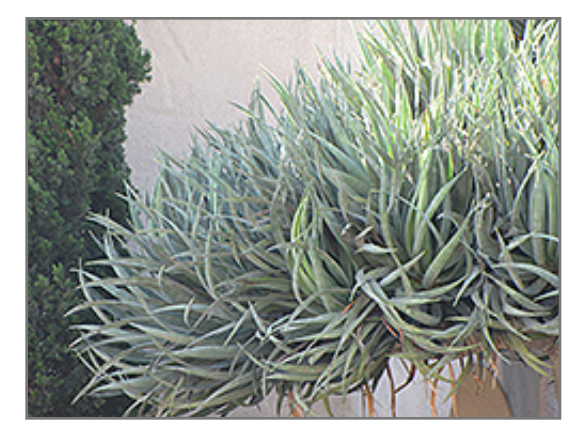
Dragon Tree foliage

This tree does best in full sun to partial shade. It prefers dry to average moisture levels with very well-drained soil, and will often die in standing water. It is considered to be drought-tolerant, and thus makes an ideal choice for xeriscaping or the moisture-conserving landscape. It is not particular as to soil type or pH. It is somewhat tolerant of urban pollution. This species is not originally from North America.