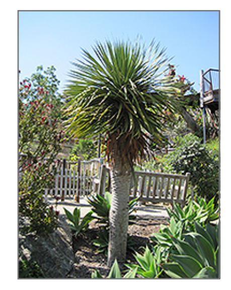
Dragon Tree

Dragon Tree is recommended for the following landscape applications;