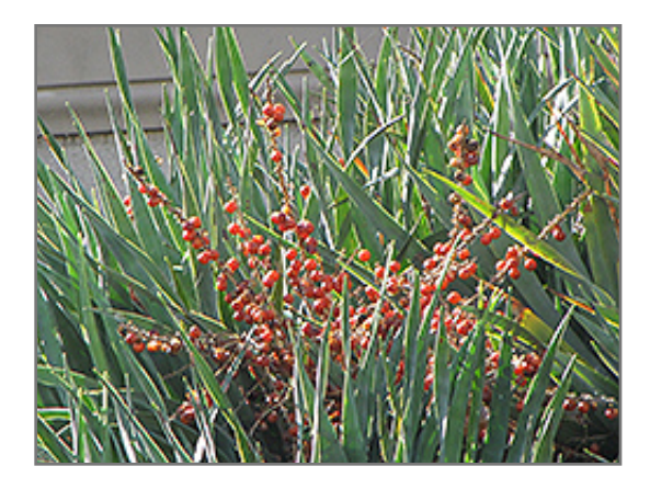
Dragon Tree fruit