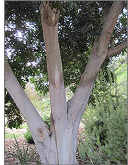
Carrotwood bark

Carrotwood is a multi-stemmed evergreen tree with an upright spreading habit of growth. Its average texture blends into the landscape, but can be balanced by one or two finer or coarser trees or shrubs for an effective composition.