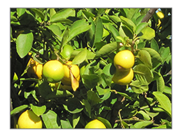
Persian Lime fruit