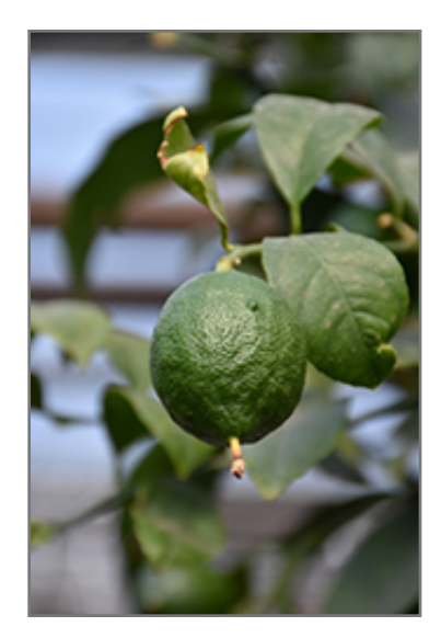
Persian Lime fruit

Persian Lime features showy clusters of fragrant white star-shaped flowers with yellow eyes at the ends of the branches from late winter to early spring. It has attractive dark green evergreen foliage. The glossy oval leaves are highly ornamental and remain dark green throughout the winter. It features an abundance of magnificent green berries in mid summer.