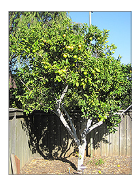
Persian Lime

Persian Lime is a good choice for the edible garden, but it is also well-suited for use in outdoor pots and containers. Its large size and upright habit of growth lend it for use as a solitary accent, or in a composition surrounded by smaller plants around the base and those that spill over the edges. It is even sizeable enough that it can be grown alone in a suitable container. Note that when grown in a container, it may not perform exactly as indicated on the tag - this is to be expected. Also note that when growing plants in outdoor containers and baskets, they may require more frequent waterings than they would in the yard or garden. Be aware that in our climate, most plants cannot be expected to survive the winter if left in containers outdoors, and this plant is no exception. Contact our experts for more information on how to protect it over the winter months.