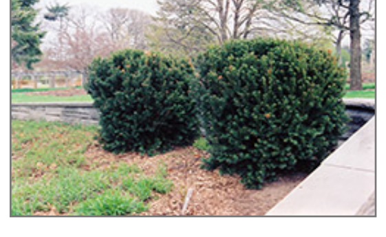
Hill's Yew

Hill's Yew will grow to be about 8 feet tall at maturity, with a spread of 7 feet. It tends to fill out right to the ground and therefore doesn't necessarily require facer plants in front, and is suitable for planting under power lines. It grows at a slow rate, and under ideal conditions can be expected to live for 50 years or more.