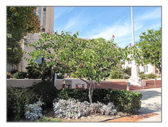
Hong Kong Orchid Tree in bloom