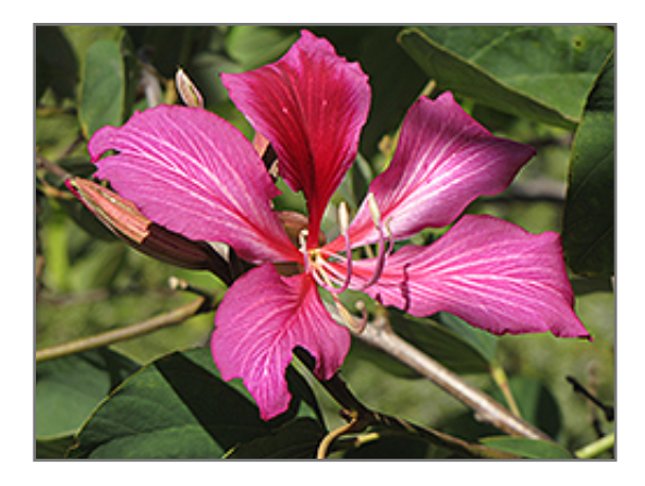
Hong Kong Orchid Tree flowers

Hong Kong Orchid Tree is recommended for the following landscape applications;