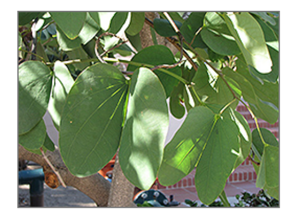
Hong Kong Orchid Tree foliage

This tree does best in full sun to partial shade. It does best in average to evenly moist conditions, but will not tolerate standing water. It is not particular as to soil type or pH, and is able to handle environmental salt. It is somewhat tolerant of urban pollution. This particular variety is an interspecific hybrid. It can be propagated by cuttings; however, as a cultivated variety, be aware that it may be subject to certain restrictions or prohibitions on propagation.