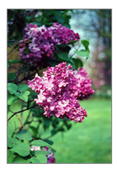
Marechal Foch Lilac flowers

A vreathtaking spring blooming shrub with pleasantly fragrant single magenta flowers in upright panicles; upright, multi-stemmed habit, very hardy, tends to sucker, ideal for screening; full sun and well-drained soil, allow room for air movement