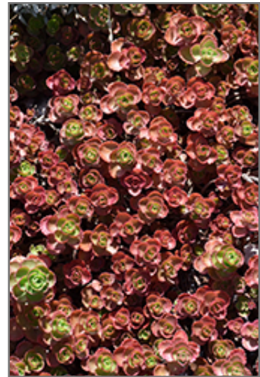
Dragon's Blood Stonecrop in fall

Dragon's Blood Stonecrop is a dense herbaceous perennial with a ground-hugging habit of growth. It brings an extremely fine and delicate texture to the garden composition and should be used to full effect.