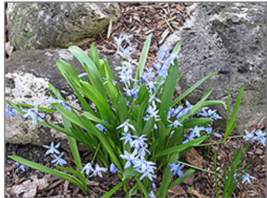
White Squill in bloom

White Squill will grow to be only 4 inches tall at maturity extending to 6 inches tall with the flowers, with a spread of 4 inches. It grows at a fast rate, and under ideal conditions can be expected to live for approximately 5 years. As an herbaceous perennial, this plant will usually die back to the crown each winter, and will regrow from the base each spring. Be careful not to disturb the crown in late winter when it may not be readily seen! As this plant tends to go dormant in summer, it is best interplanted with late-season bloomers to hide the dying foliage.