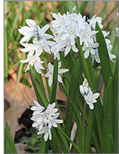
White Squill flowers

White Squill will grow to be only 4 inches tall at maturity extending to 6 inches tall with the flowers, with a spread of 4 inches. It grows at a fast rate, and under ideal conditions can be expected to live for approximately 5 years. As an herbaceous perennial, this plant will usually die back to the crown each winter, and will regrow from the base each spring. Be careful not to disturb the crown in late winter when it may not be readily seen! As this plant tends to go dormant in summer, it is best interplanted with late-season bloomers to hide the dying foliage.