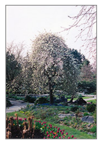
Weeping Willowleaf Pear in bloom

Weeping Willowleaf Pear is recommended for the following landscape applications;