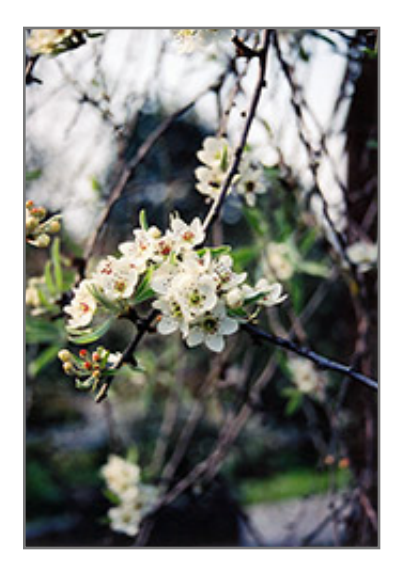
Weeping Willowleaf Pear flowers