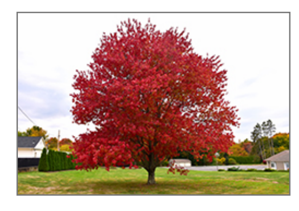
Red Maple in fall

The tree that lights up New England yellow and red in fall; a great shade tree, but very intolerant of alkaline soils; fall color is not consistently red in the species, so the many named cultivars are often chosen