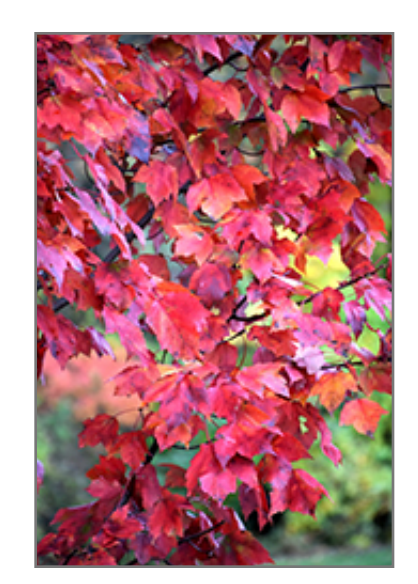
Red Maple in fall