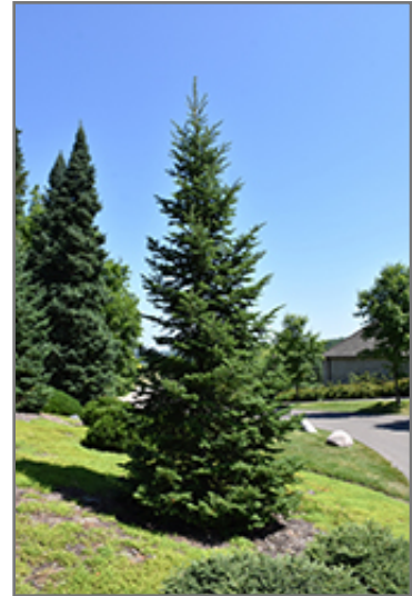
Balsam Fir