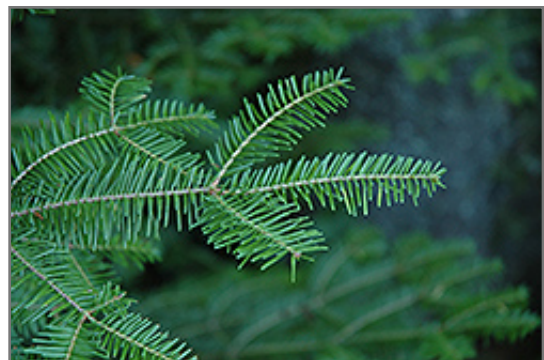
Balsam Fir foliage