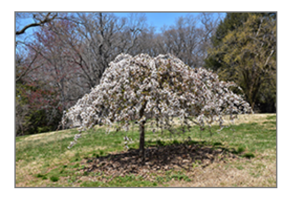
Snow Fountains Yoshino Cherry in bloom

This dwarf tree will require occasional maintenance and upkeep, and is best pruned in late winter once the threat of extreme cold has passed. It has no significant negative characteristics.