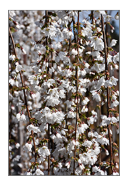
Snow Fountains Yoshino Cherry flowers