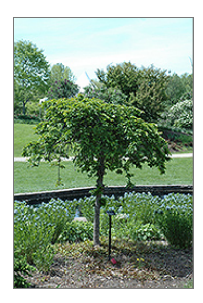
Snow Fountains Yoshino Cherry

This dwarf tree should only be grown in full sunlight. It does best in average to evenly moist conditions, but will not tolerate standing water. It is not particular as to soil pH, but grows best in rich soils. It is highly tolerant of urban pollution and will even thrive in inner city environments, and will benefit from being planted in a relatively sheltered location. This particular variety is an interspecific hybrid.