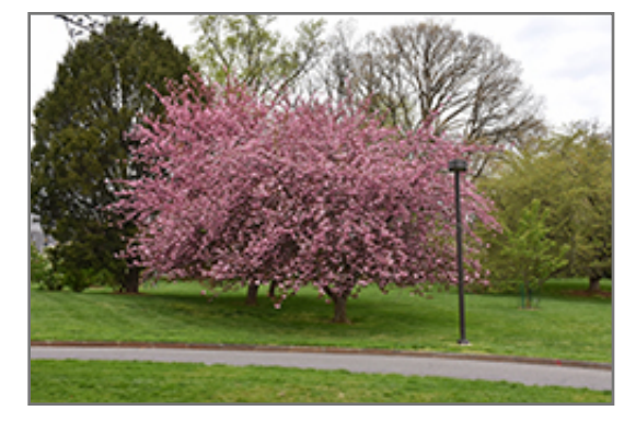
Royal Burgundy Flowering Cherry in bloom