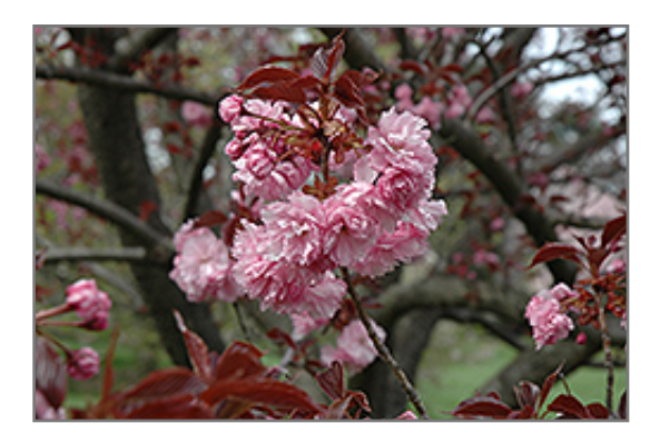
Royal Burgundy Flowering Cherry flowers

Royal Burgundy Flowering Cherry is a deciduous tree with an upright spreading habit of growth. Its average texture blends into the landscape, but can be balanced by one or two finer or coarser trees or shrubs for an effective composition.