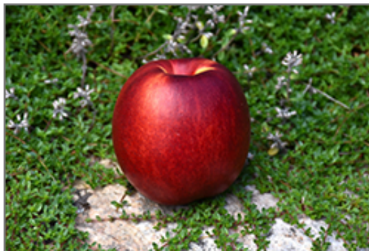
Fantasia Nectarine fruit

Fantasia Nectarine is draped in stunning clusters of fragrant pink flowers along the branches in early spring, which emerge from distinctive rose flower buds before the leaves. It has dark green deciduous foliage. The narrow leaves turn yellow in fall. The fruits are showy yellow drupes with cherry red overtones, which are carried in abundance in late summer. The fruit can be messy if allowed to drop on the lawn or walkways, and may require occasional clean-up.