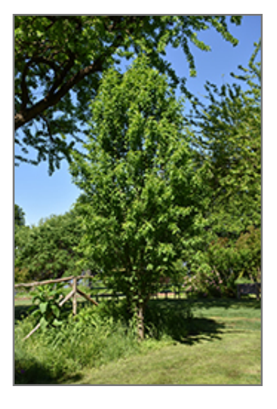
Corinthian White Flowering Peach

This tree should only be grown in full sunlight. It does best in average to evenly moist conditions, but will not tolerate standing water. It is not particular as to soil type or pH. It is highly tolerant of urban pollution and will even thrive in inner city environments, and will benefit from being planted in a relatively sheltered location. This is a selected variety of a species not originally from North America.