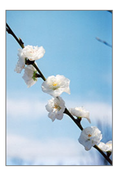
Corinthian White Flowering Peach flowers

Corinthian White Flowering Peach is recommended for the following landscape applications;