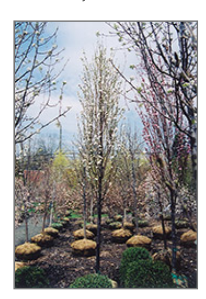
Corinthian White Flowering Peach in bloom