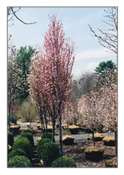
Corinthian Rose Flowering Peach in bloom

Corinthian Rose Flowering Peach is recommended for the following landscape applications;