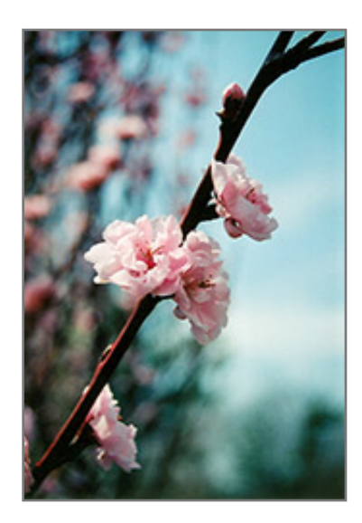
Corinthian Rose Flowering Peach flowers