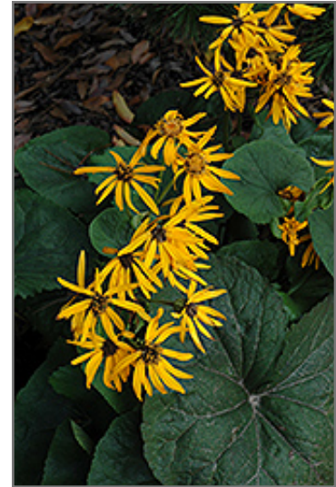
Hodgson's Leopard Plant flowers

Hodgson's Leopard Plant is recommended for the following landscape applications;