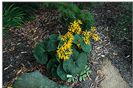
Hodgson's Leopard Plant in bloom