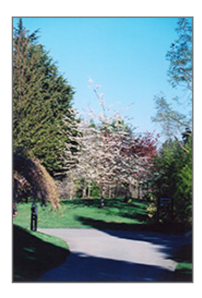
Double Flowering Sweet Cherry in bloom

Double Flowering Sweet Cherry is recommended for the following landscape applications;