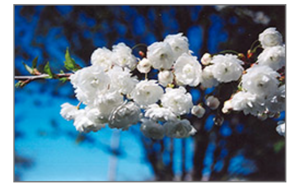
Double Flowering Sweet Cherry flowers

An upright-rounded feature tree which is covered in luxurious double white flowers in spring; a sterile variety that produces no fruit; a real showpiece worth seeking out; needs full sun and well drained soil, flowers are susceptible to late spring frosts