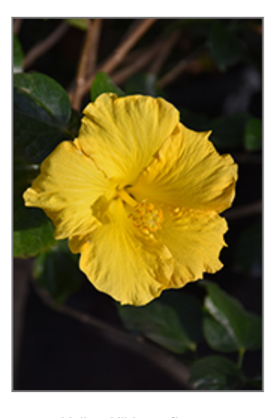
Yellow Hibiscus flowers

This plant is native to the tropics and prefers growing in moist environments with evenly warm conditions all year round. In our climate, it is usually grown as an outdoor annual in the garden or in a container. If you want it to survive the winter, it can be brought in to the house and provided with special care, and then returned to the garden the following season. In its preferred tropical habitat, it can grow to be around 10 feet tall at maturity, with a spread of 10 feet. However, when grown as an annual or when overwintered indoors, it can be expected to perform differently, and its exact height and spread will depend on many factors; you may wish to consult with our experts as to how it might perform in your specific application and growing conditions.