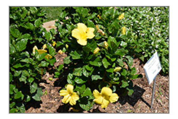
Yellow Hibiscus in bloom