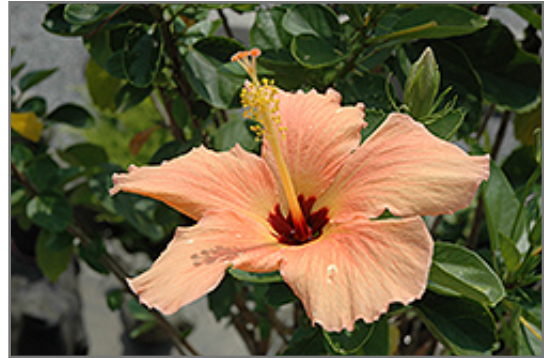
Peach Hibiscus flowers

This plant does best in full sun to partial shade. It requires an evenly moist well-drained soil for optimal growth, but will die in standing water. It is not particular as to soil type or pH. It is highly tolerant of urban pollution and will even thrive in inner city environments. Consider applying a thick mulch around the root zone in winter to protect it in exposed locations or colder microclimates. This is a selected variety of a species not originally from North America. It can be propagated by cuttings; however, as a cultivated variety, be aware that it may be subject to certain restrictions or prohibitions on propagation.