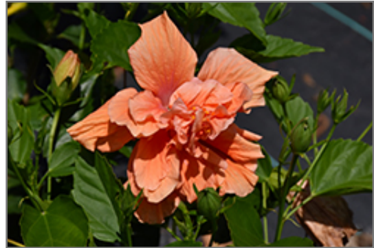
Double Peach Hibiscus flowers

This plant does best in full sun to partial shade. It requires an evenly moist well-drained soil for optimal growth, but will die in standing water. It is not particular as to soil type or pH. It is highly tolerant of urban pollution and will even thrive in inner city environments. Consider applying a thick mulch around the root zone in winter to protect it in exposed locations or colder microclimates. This is a selected variety of a species not originally from North America. It can be propagated by cuttings; however, as a cultivated variety, be aware that it may be subject to certain restrictions or prohibitions on propagation.