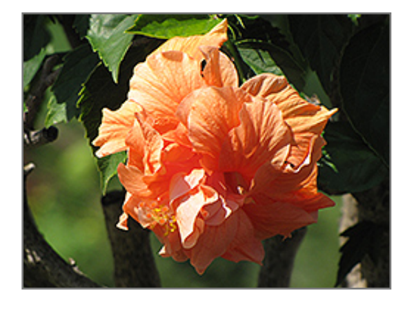
Double Orange Hibiscus flowers

This plant is native to the tropics and prefers growing in moist environments with evenly warm conditions all year round. In our climate, it is usually grown as an outdoor annual in the garden or in a container. If you want it to survive the winter, it can be brought in to the house and provided with special care, and then returned to the garden the following season. In its preferred tropical habitat, it can grow to be around 6 feet tall at maturity, with a spread of 5 feet. However, when grown as an annual or when overwintered indoors, it can be expected to perform differently, and its exact height and spread will depend on many factors; you may wish to consult with our experts as to how it might perform in your specific application and growing conditions.