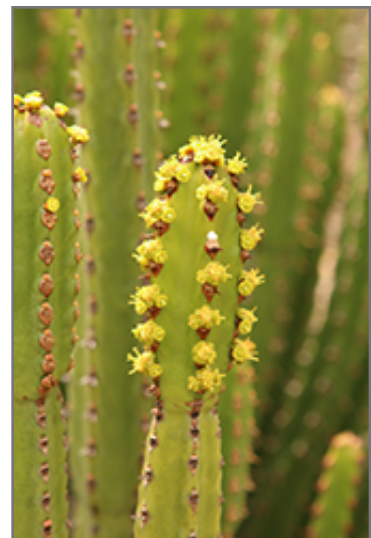
African Milk Tree flowers