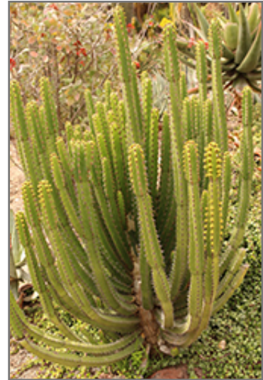
African Milk Tree

African Milk Tree is recommended for the following landscape applications;