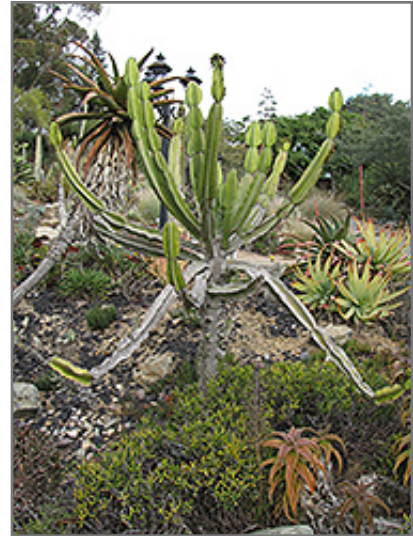
River Euphorbia