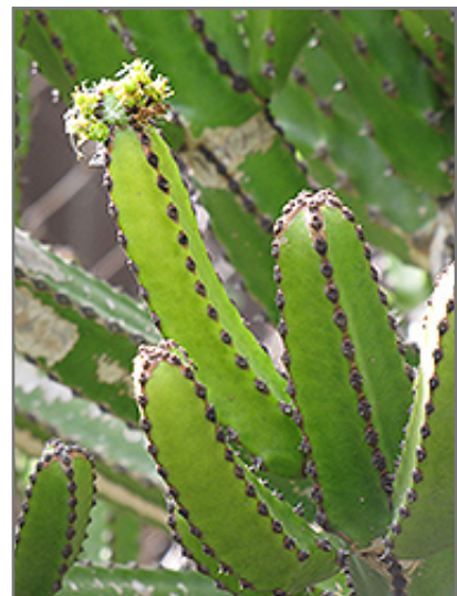
Naboom flowers