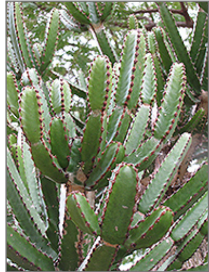
Naboom foliage

Naboom is recommended for the following landscape applications;