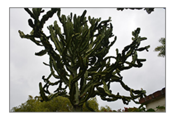
Candelabra Tree

This plant does best in full sun to partial shade. It prefers dry to average moisture levels with very well-drained soil, and will often die in standing water. It is considered to be drought-tolerant, and thus makes an ideal choice for xeriscaping or the moisture-conserving landscape. It is not particular as to soil pH, but grows best in sandy soils. It is highly tolerant of urban pollution and will even thrive in inner city environments. This species is not originally from North America, and parts of it are known to be toxic to humans and animals, so care should be exercised in planting it around children and pets.