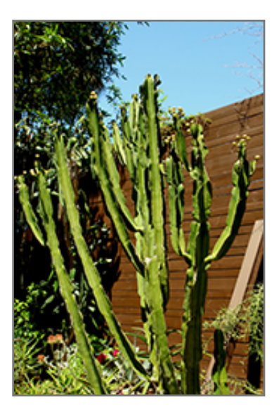
Candelabra Tree

This is a relatively low maintenance plant, and should not require much pruning, except when necessary, such as to remove dieback. Deer don't particularly care for this plant and will usually leave it alone in favor of tastier treats. Gardeners should be aware of the following characteristic(s) that may warrant special consideration;