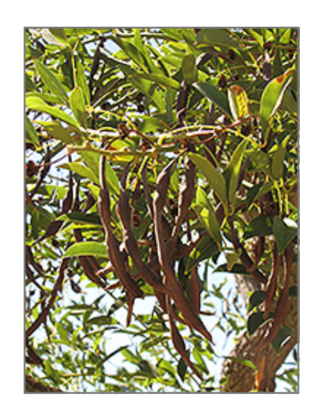
Cockspur Coral Tree fruit

This tree should only be grown in full sunlight. It prefers dry to average moisture levels with very well-drained soil, and will often die in standing water. It is considered to be drought-tolerant, and thus makes an ideal choice for xeriscaping or the moisture-conserving landscape. It is not particular as to soil type or pH. It is somewhat tolerant of urban pollution. Consider applying a thick mulch around the root zone in winter to protect it in exposed locations or colder microclimates. This species is not originally from North America, and parts of it are known to be toxic to humans and animals, so care should be exercised in planting it around children and pets.