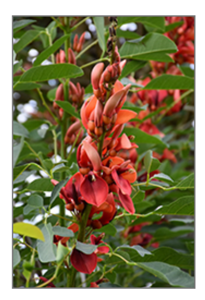
Cockspur Coral Tree flowers

Cockspur Coral Tree is recommended for the following landscape applications;