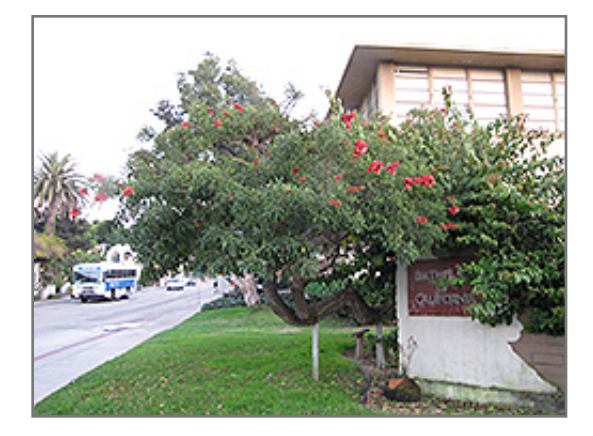
Cockspur Coral Tree in bloom