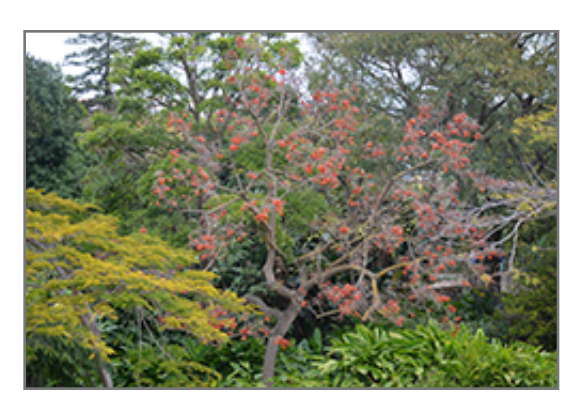
Naked Coral Tree in bloom

This is a relatively low maintenance tree, and should only be pruned after flowering to avoid removing any of the current season's flowers. It is a good choice for attracting bees, butterflies and hummingbirds to your yard. It has no significant negative characteristics.