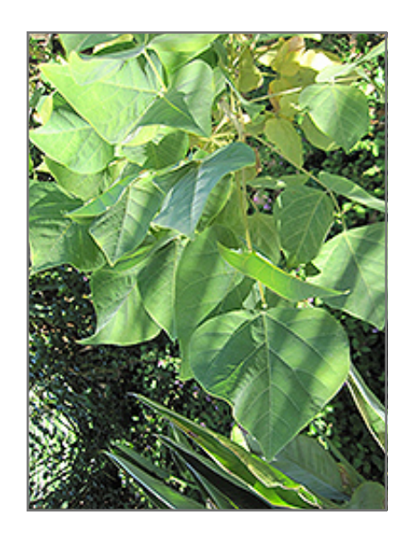
Naked Coral Tree foliage

This tree should only be grown in full sunlight. It prefers dry to average moisture levels with very well-drained soil, and will often die in standing water. It is considered to be drought-tolerant, and thus makes an ideal choice for xeriscaping or the moisture-conserving landscape. It is not particular as to soil type or pH. It is somewhat tolerant of urban pollution. Consider applying a thick mulch around the root zone in winter to protect it in exposed locations or colder microclimates. This species is not originally from North America, and parts of it are known to be toxic to humans and animals, so care should be exercised in planting it around children and pets.