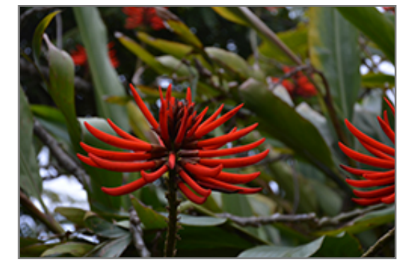
Naked Coral Tree flowers

A deciduous tree with an upright, spreading habit on a furrowed trunk; dazzling orange-red flower clusters before the leaves in late winter until spring; attractive large green leaves; attracts hummingbirds