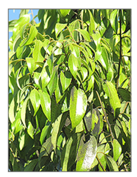
Chinese Cinnamon foliage