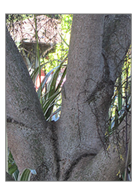
Chinese Cinnamon bark