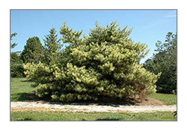
Dragon's Eye Japanese Red Pine

This is a relatively low maintenance tree. When pruning is necessary, it is recommended to only trim back the new growth of the current season, other than to remove any dieback. It has no significant negative characteristics.