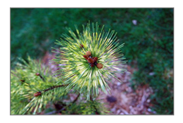
Dragon's Eye Japanese Red Pine foliage

Dragon's Eye Japanese Red Pine is an evergreen tree with a strong central leader and a more or less rounded form. Its relatively fine texture sets it apart from other landscape plants with less refined foliage.