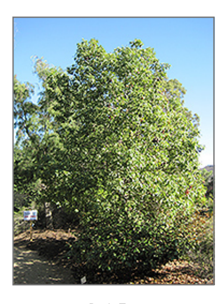
Bottle Tree

Bottle Tree features showy clusters of white bell-shaped flowers with pink spots at the ends of the branches in early summer. It has dark green evergreen foliage. The pointy leaves remain dark green throughout the winter. The fruits are showy brown pods displayed from late summer to early fall. The smooth gray bark adds an interesting dimension to the landscape.