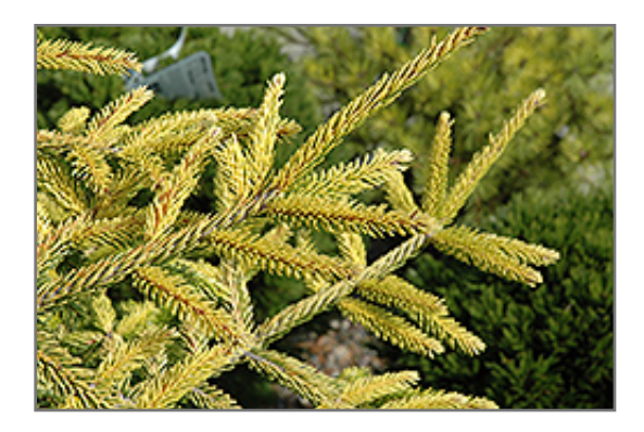
Skylands Golden Spruce foliage