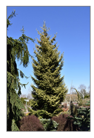
Skylands Golden Spruce