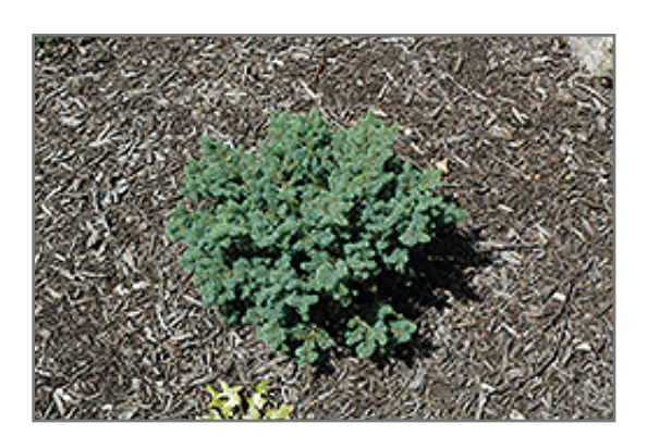
Blue Nest Spruce

A dense and compact mounded shrub with a characteristic depression in the center (hence the name), colorful fine-textured bluish-green needles; adaptable and hardy, an excellent choice for form and texture in the garden or for rock gardens