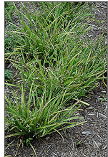
Morning Glory Spiderwort in bloom