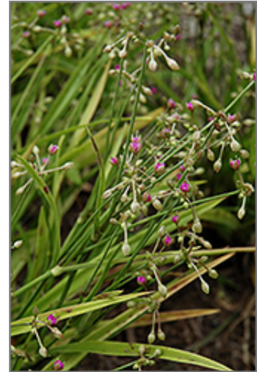
Morning Glory Spiderwort flowers

Morning Glory Spiderwort is recommended for the following landscape applications;