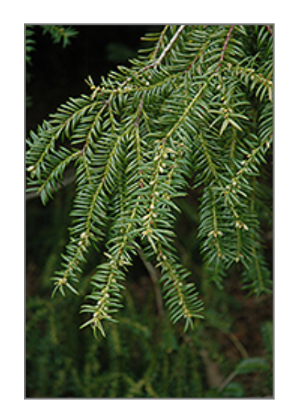
Japanese Torreya foliage