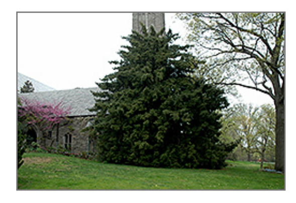
Japanese Torreya

An unusual and rare evergreen of Japanese origin that is a member of the yew family; dark green, glossy foliage makes a great backdrop on the landscape; very slow growing with a loose pyramidal habit; protect from winter winds