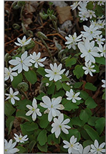
Rue Anemone flowers

Rue Anemone will grow to be only 6 inches tall at maturity, with a spread of 8 inches. When grown in masses or used as a bedding plant, individual plants should be spaced approximately 6 inches apart. Its foliage tends to remain low and dense right to the ground. It grows at a medium rate, and under ideal conditions can be expected to live for approximately 5 years. As an herbaceous perennial, this plant will usually die back to the crown each winter, and will regrow from the base each spring. Be careful not to disturb the crown in late winter when it may not be readily seen!