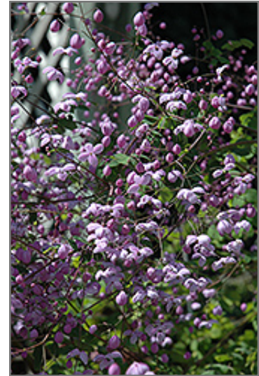
Twinkling Star Meadow Rue flowers