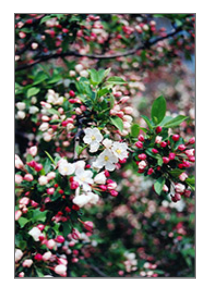
Sargent's Pink Flowering Crab flowers

Sargent's Pink Flowering Crab is a dense spreading deciduous shrub with a stunning habit of growth which features almost oriental horizontally-tiered branches. Its average texture blends into the landscape, but can be balanced by one or two finer or coarser trees or shrubs for an effective composition.