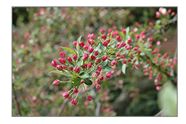
Sargent's Pink Flowering Crab flowers