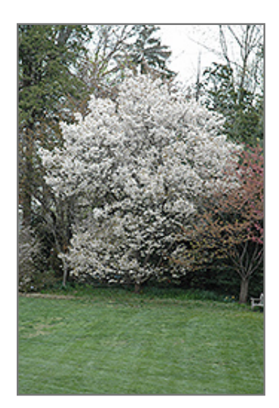
Ojochin Flowering Cherry in bloom

This tree will require occasional maintenance and upkeep, and is best pruned in late winter once the threat of extreme cold has passed. Gardeners should be aware of the following characteristic(s) that may warrant special consideration;