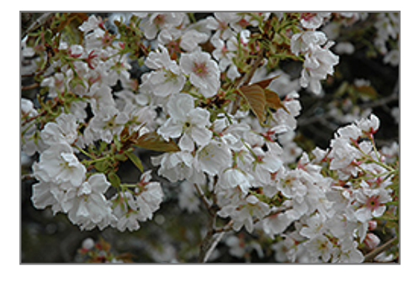
Ojochin Flowering Cherry flowers

A superb landscape ornamental smothered in large white flowers with a pink flush in early spring before the leaves; good fall color and spreading habit; one of the largest flowering varieties, needs full sun and well-drained soil