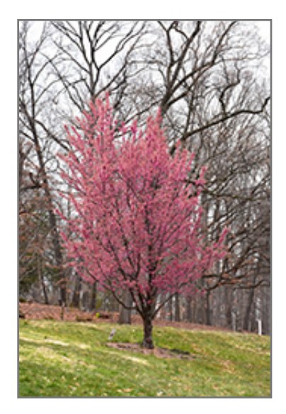
First Lady Flowering Cherry in bloom