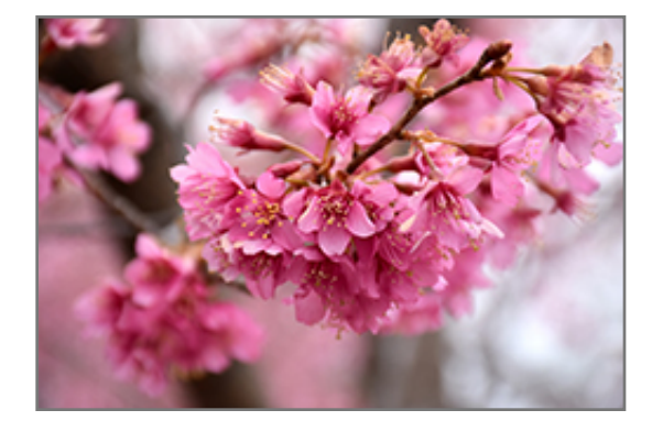
First Lady Flowering Cherry flowers

This is a relatively low maintenance tree, and is best pruned in late winter once the threat of extreme cold has passed. It is a good choice for attracting birds to your yard. It has no significant negative characteristics.