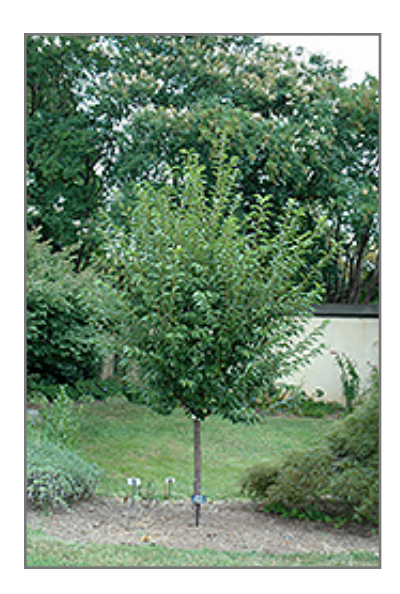
First Lady Flowering Cherry

This tree should only be grown in full sunlight. It does best in average to evenly moist conditions, but will not tolerate standing water. It is not particular as to soil pH, but grows best in rich soils. It is highly tolerant of urban pollution and will even thrive in inner city environments. This particular variety is an interspecific hybrid.