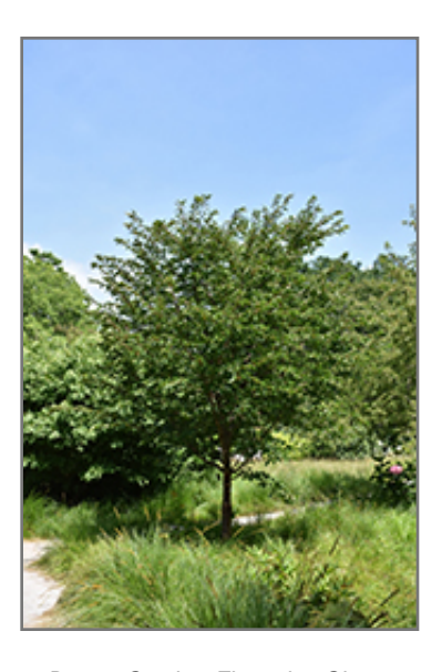
Dream Catcher Flowering Cherry

This tree should only be grown in full sunlight. It does best in average to evenly moist conditions, but will not tolerate standing water. It is not particular as to soil pH, but grows best in rich soils. It is highly tolerant of urban pollution and will even thrive in inner city environments. This particular variety is an interspecific hybrid.