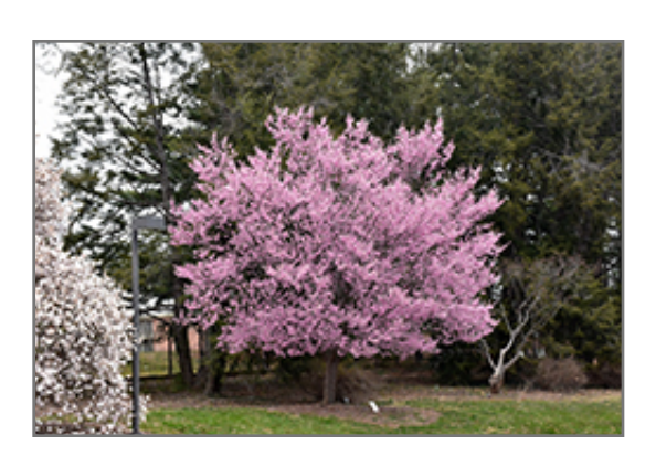
Dream Catcher Flowering Cherry in bloom

This is a relatively low maintenance tree, and is best pruned in late winter once the threat of extreme cold has passed. It is a good choice for attracting birds to your yard. It has no significant negative characteristics.