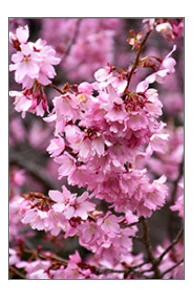
Dream Catcher Flowering Cherry flowers