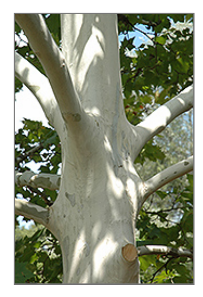
Variegated London Planetree bark