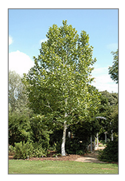
Variegated London Planetree

Variegated London Planetree is recommended for the following landscape applications;