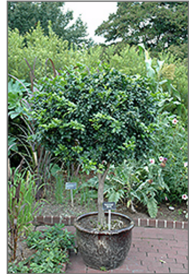
Orange Jessamine (tree form)