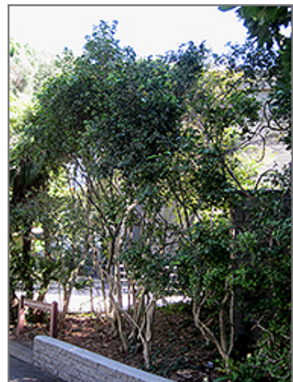
Orange Jessamine