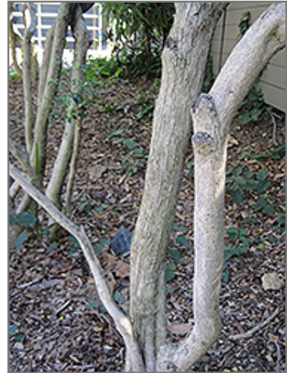
Orange Jessamine bark

Orange Jessamine is recommended for the following landscape applications;