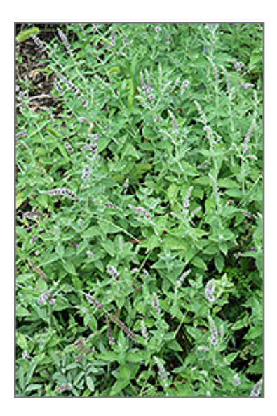
Pennyroyal in bloom

This is a relatively low maintenance plant, and should be cut back in late fall in preparation for winter. It is a good choice for attracting bees and butterflies to your yard, but is not particularly attractive to deer who tend to leave it alone in favor of tastier treats. Gardeners should be aware of the following characteristic(s) that may warrant special consideration;