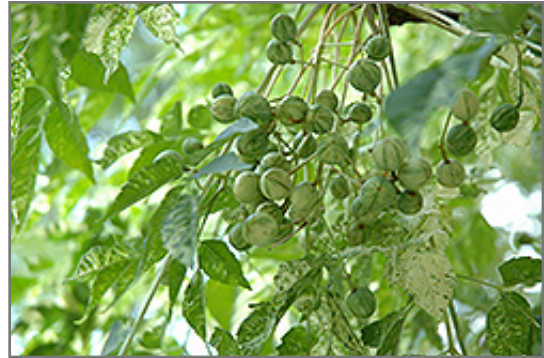
Jade Snowflake Variegated Chinaberry fruit