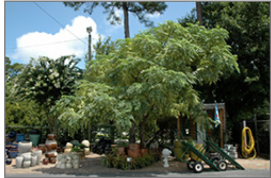
Jade Snowflake Variegated Chinaberry

Jade Snowflake Variegated Chinaberry is a multi-stemmed deciduous tree with a shapely oval form. Its average texture blends into the landscape, but can be balanced by one or two finer or coarser trees or shrubs for an effective composition.