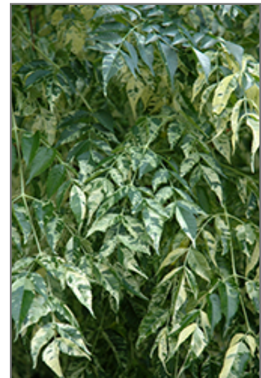
Jade Snowflake Variegated Chinaberry foliage