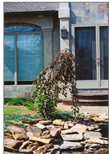
Royal Beauty Flowering Crab