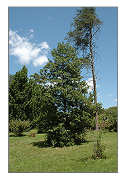
Southern Sweetbay Magnolia

This is a relatively low maintenance tree, and should only be pruned after flowering to avoid removing any of the current season's flowers. Deer don't particularly care for this plant and will usually leave it alone in favor of tastier treats. It has no significant negative characteristics.