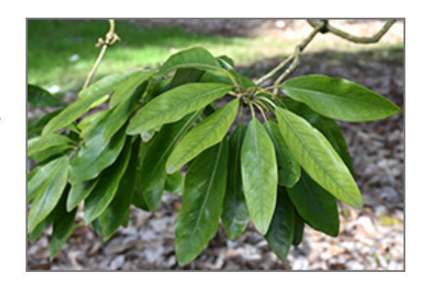
Southern Sweetbay Magnolia foliage

Southern Sweetbay Magnolia is recommended for the following landscape applications;